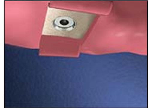
Small titanium cylinders

Some people just aren't able to comfortably wear an upper denture. It doesn't stay in place, it gags them when they talk or chew, or it hurts constantly. The transition from their own teeth to an upper denture just never worked out. If you're one of these people and you'd love to get rid of your upper denture, then implants may be the answer.