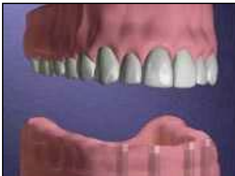
Implants in lower jaw

Using dental implants to support either a lower denture or bridge will keep the pressure off the bone and the nerves. The implants also help stop the bone loss in the jaw that continues once teeth have been removed. Securing restorations with dental implants can make a world of difference, allowing you to eat, talk, laugh, and smile with confidence again.