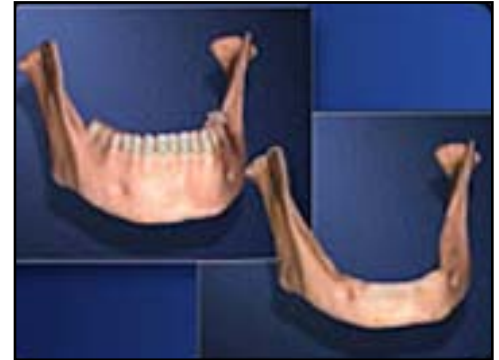
Receding jaw bone

If you have a lower denture, you probably know how hard it can be to eat comfortably. When lower teeth are lost, the bone in the jaw continually recedes. Over time, this causes a lower denture to become loose and floppy. Even worse, there are nerves in the lower jaw that can end up on the surface of the bone. When you bite down, it hurts!