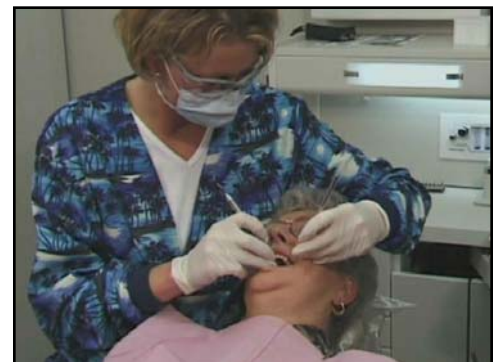
Professional cleanings are key

As you can see, it's vital to your overall health, as well as your oral health, to keep your gums healthy. If we determine that you have periodontal disease, we'll suggest therapies specific to your condition, have you in for more frequent professional cleanings, and work with you to create a suitable at-home oral hygiene routine.