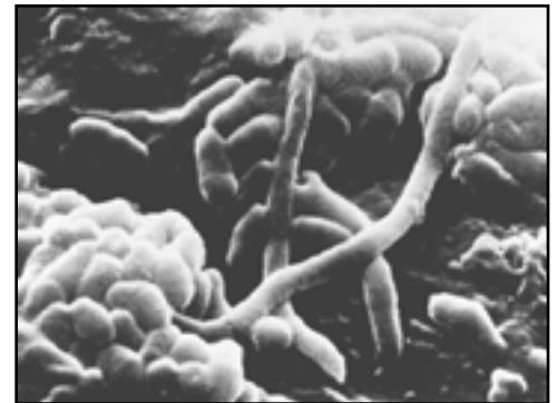
Microscopic view of plaque

Bleeding gums can create an opening that allows harmful bacteria in your mouth to enter your bloodstream. Severe periodontal disease can be compared to a nine-square-inch open wound around your teeth, offering plenty of opportunities for harmful bacteria to enter your blood.