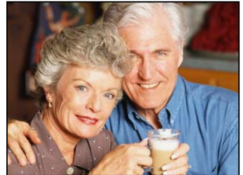
In time, you'll adjust to dentures

Like learning any new skill, eating with your new denture will at first feel awkward. But with time and practice, you'll make the adjustment. Nobody likes to lose their teeth, but when your teeth are infected, removing them and getting an immediate denture can improve your health, smile, and confidence.