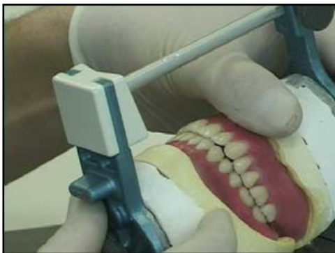
Creating a precise fit

To begin the process of making a denture, we first take impressions of your mouth. From these impressions, we make precise working models of your mouth, and it's on these models that we make the denture. We'll work with you to select the best color and shape for your new teeth. When your denture is ready, we'll thoroughly numb your mouth and extract your remaining teeth. After your teeth are removed, we'll immediately place your denture.