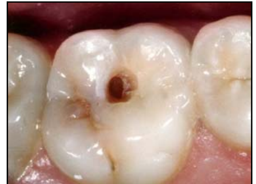
A visible cavity

The widespread use of fluoride to fight cavities has been the greatest breakthrough in the past fifty years of preventive dentistry. Fluoride can help prevent cavities by actually hardening the outer enamel layer of teeth, and it can even stop or slow down the growth of pre-existing cavities.